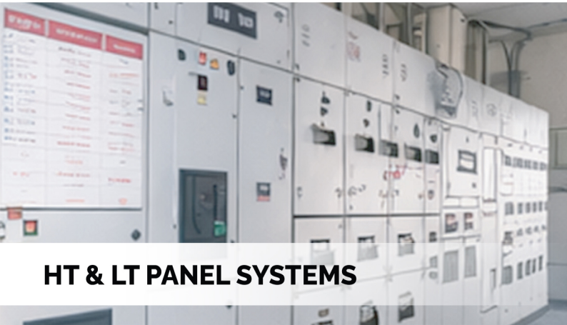
HT & LT PANEL SYSTEMS