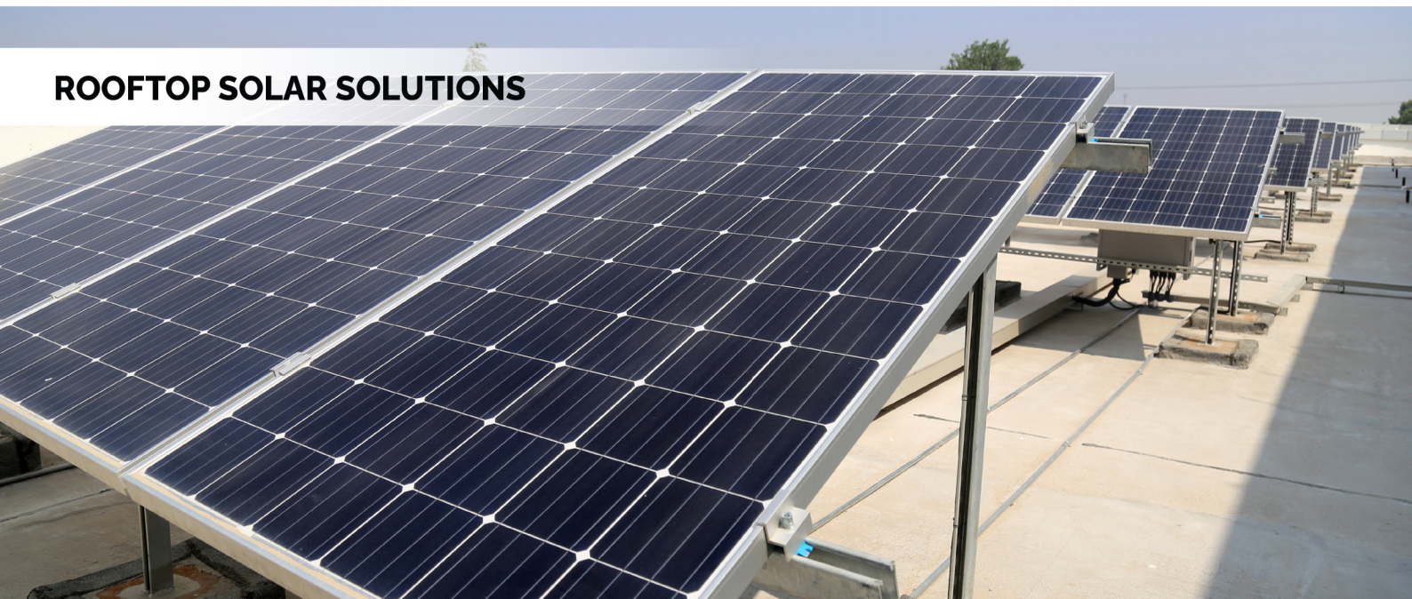
ROOFTOP SOLAR SOLUTIONS