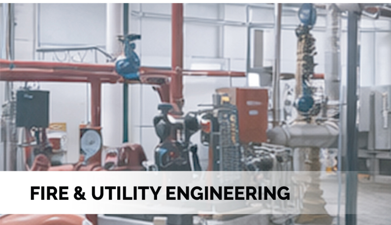
FIRE & UTILITY ENGINEERING