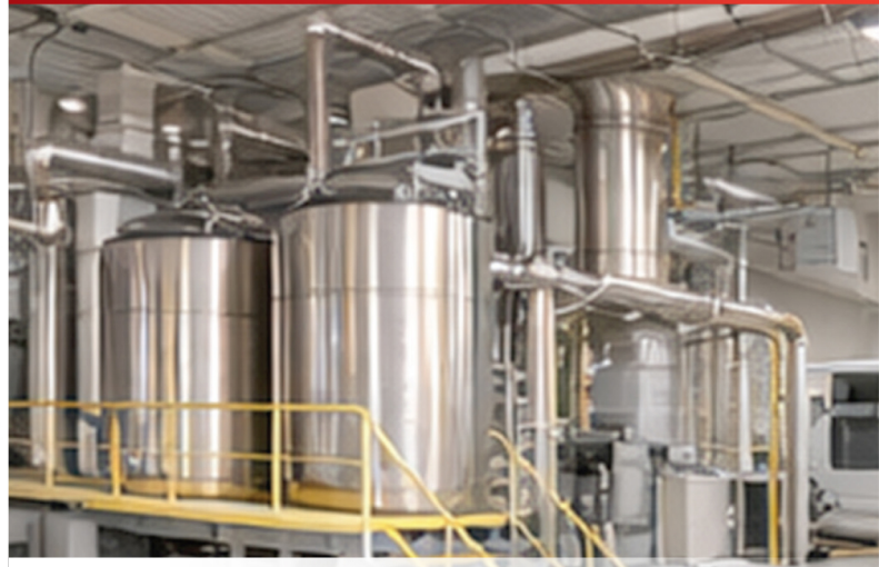
PROCESS PLANT INSTALLATIONS